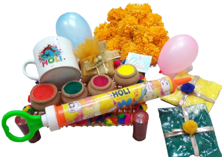
Holi / Sankranth

Our Indian festivals offer opportunities to strengthen relations with Indian and Overseas clients